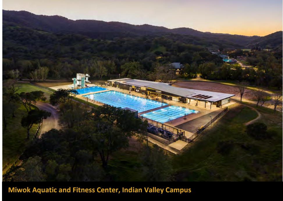
Miwok Aquatic and Fitness Center, Indian Valley Campus

Spring is underway and facility use and rentals are busy. It has been great to have students, faculty, staff and our community back on our campuses. There are lots of campus, aquatic and private events happening across both campuses, especially at the Jonas Center and the Miwok Aquatic and Fitness Center.