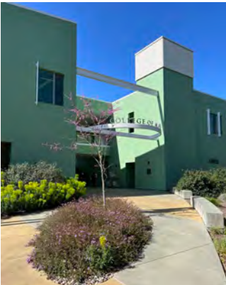
Indian Valley Campus Building 27

We can do that! Simply click here to get started. We will arrange an intake meeting to discuss the event and your needs.