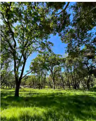
Indian Valley Campus Woodlands