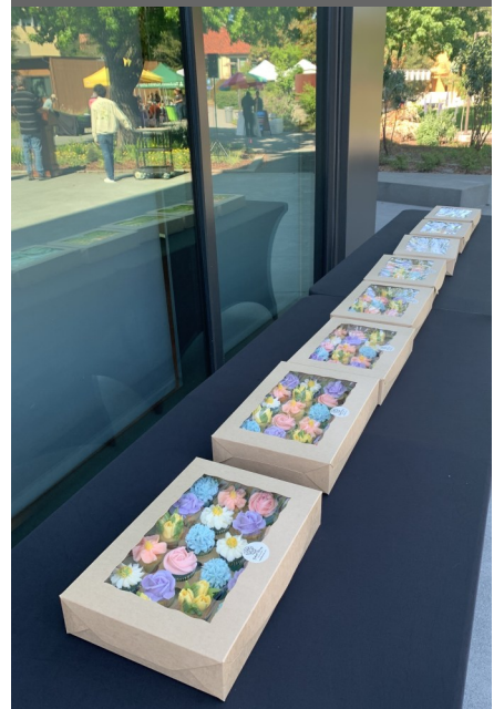
Founder's Day Spring Fling, Kentfield

The Bill and Adele Jonas Center has won its 4 th Marin IJ Reader's Choice Award for best Convention/Event/ Meeting Space.