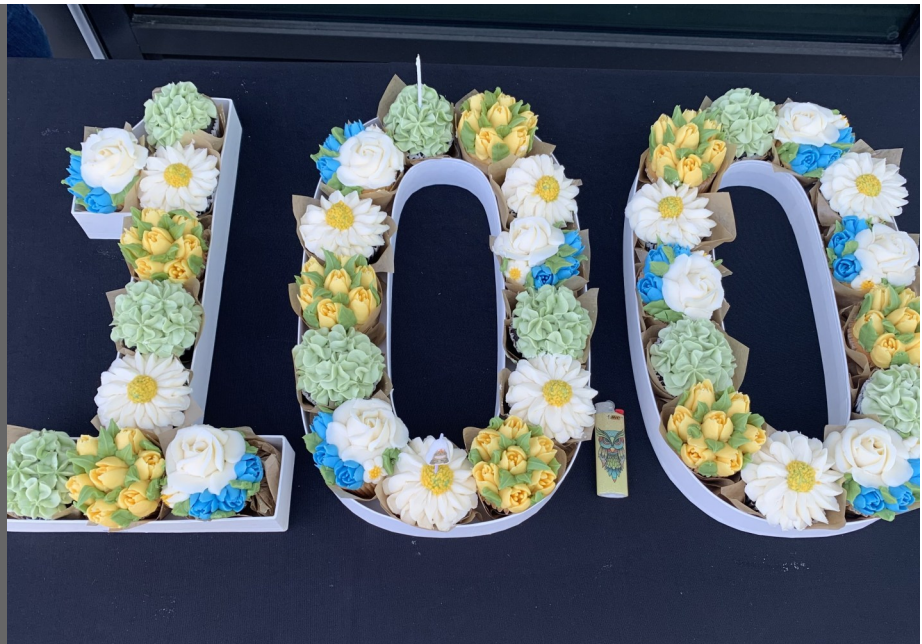
Founder's Day Spring Fling, Kentfield Campus

When folks come back for our next academic year, there will be updated centralized waste stations set up in the Academic Center and the Science, Math, and Nursing buildings.