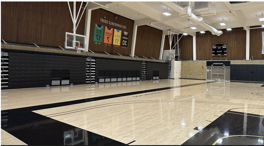
Diamond PE Center Gymnasium, Kentfield Campus