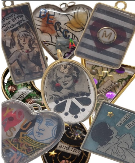
Charms from Resin Charms Workshop with Lara Starr

Fine Arts 312, Tuesdays 3:10-6pm • June 16-July 21