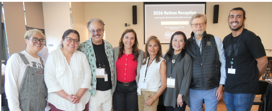
Annual Retiree Reception, Kentfield Campus