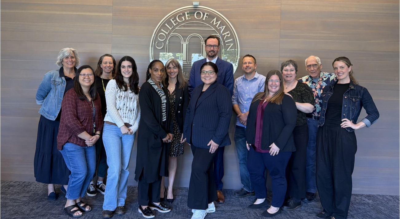
College Council, Kentfield Campus