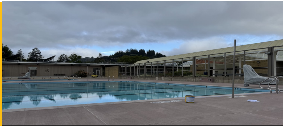
Diamond PE Center Pool, Kentfield Campus