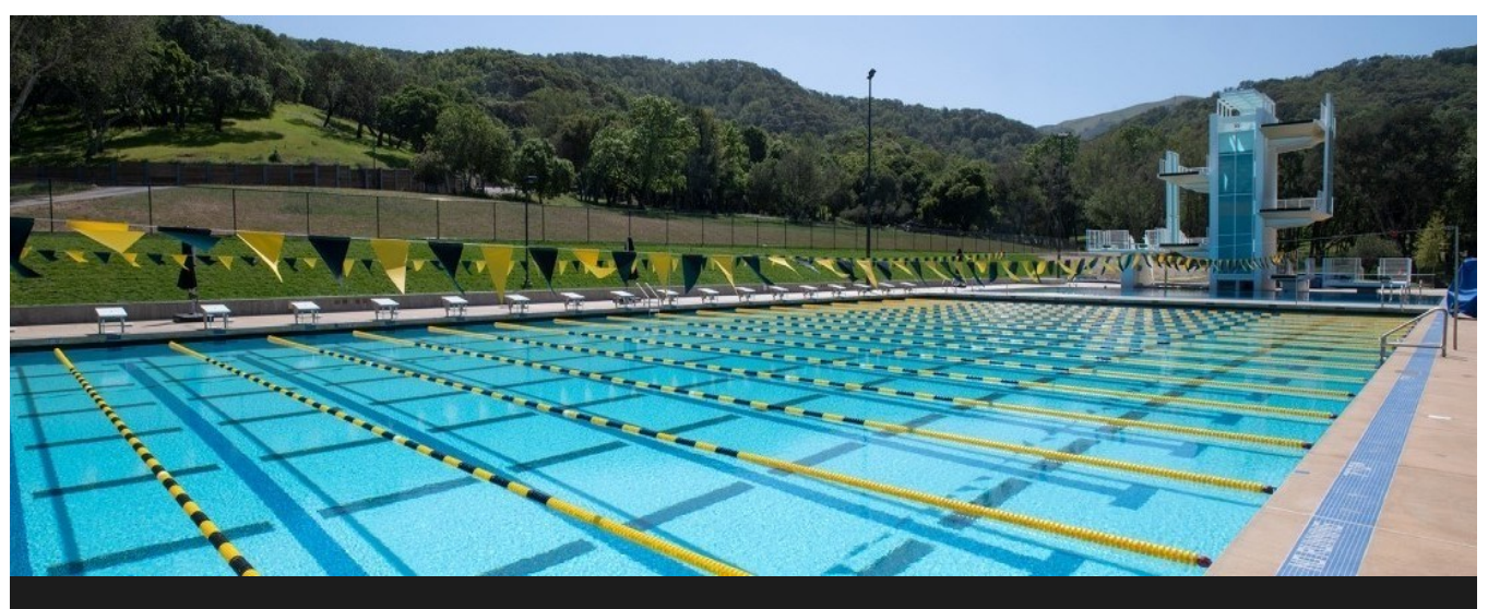
Miwok Aquatic and Fitness Center, Indian Valley Campus