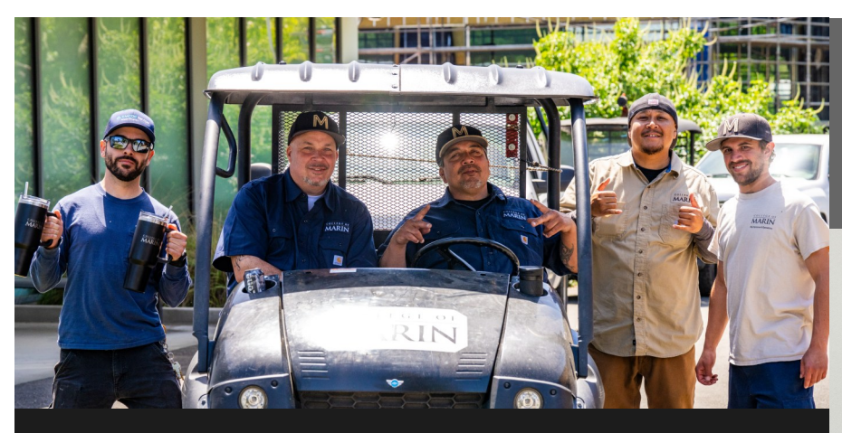
Maintenance & Operations Staff, Spring Fling, Kentfield Campus