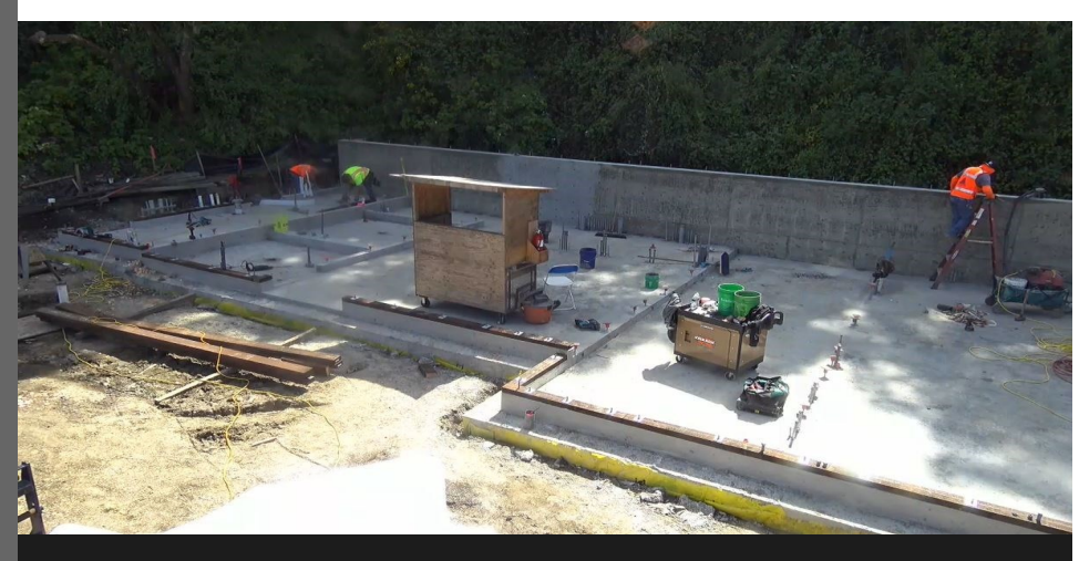
Bolinas Field Station Foundation, Bolinas

The foundation for the Field Station has been poured along with the retaining wall. These are two major milestones for this project. The exterior walls will begin to be framed in the coming weeks.