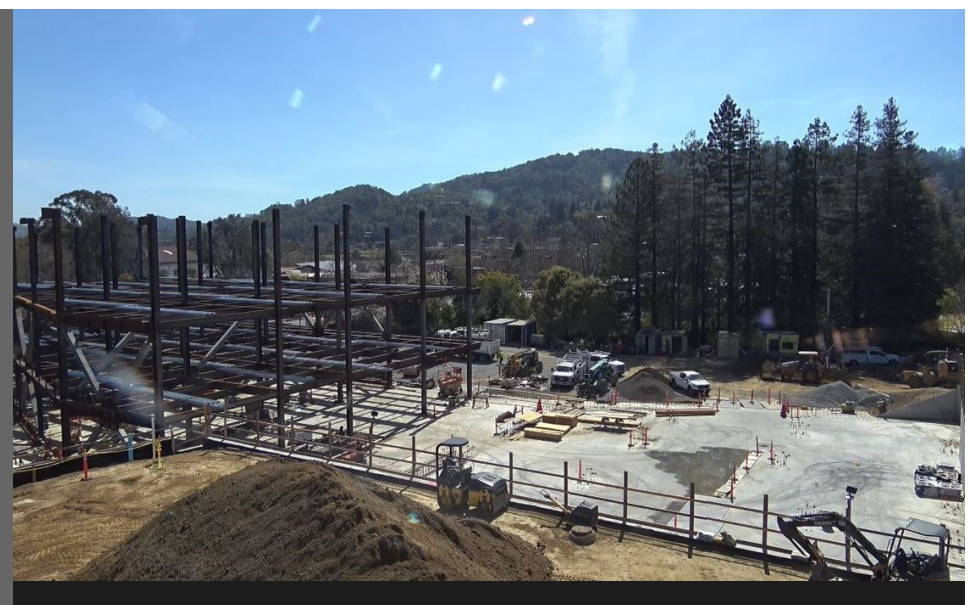
Learning Resources Center Steel Erection, Kentfield Campus

The District is partnering with Marin County Fire District on the design and construction of a facility that will support the Fire Foundry program. Meetings with the A/E firm, HGA are ongoing.