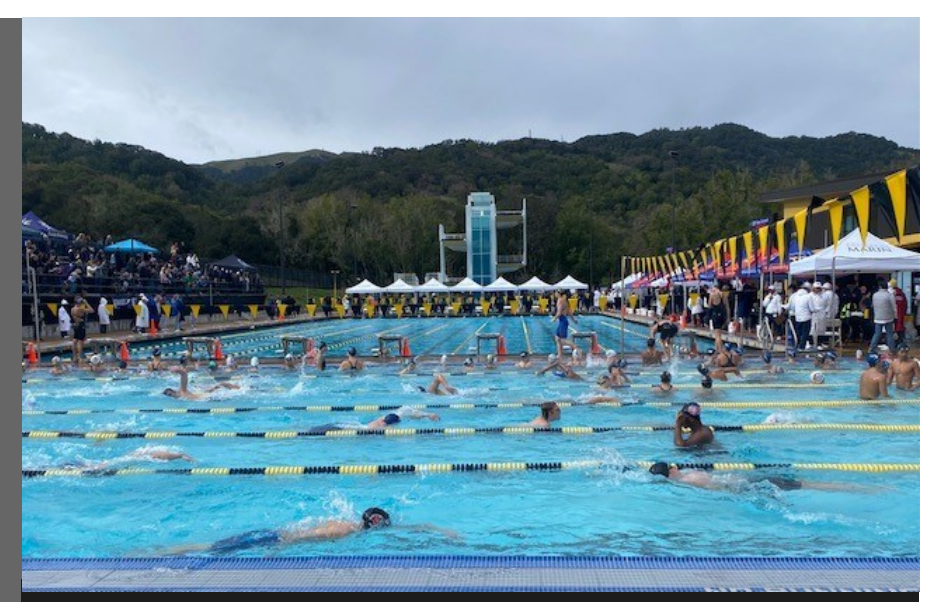
Speedo Sectionals Swim Meet, Miwok Aquatic & Fitness Center, Indian Valley Campus