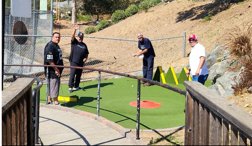
Maintenance & Operations staff, McInnis Park

The week of September 11 th through September 15 th was custodial appreciation week. Each day of the week, COM staff and managers have been recognizing the hard work of our custodial team to show how thankful we are for them. Management provided them with snacks, coffee, pizza and other treats.