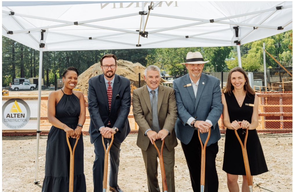
Executive staff, LRC Groundbreaking Ceremony, Kentfield Campus