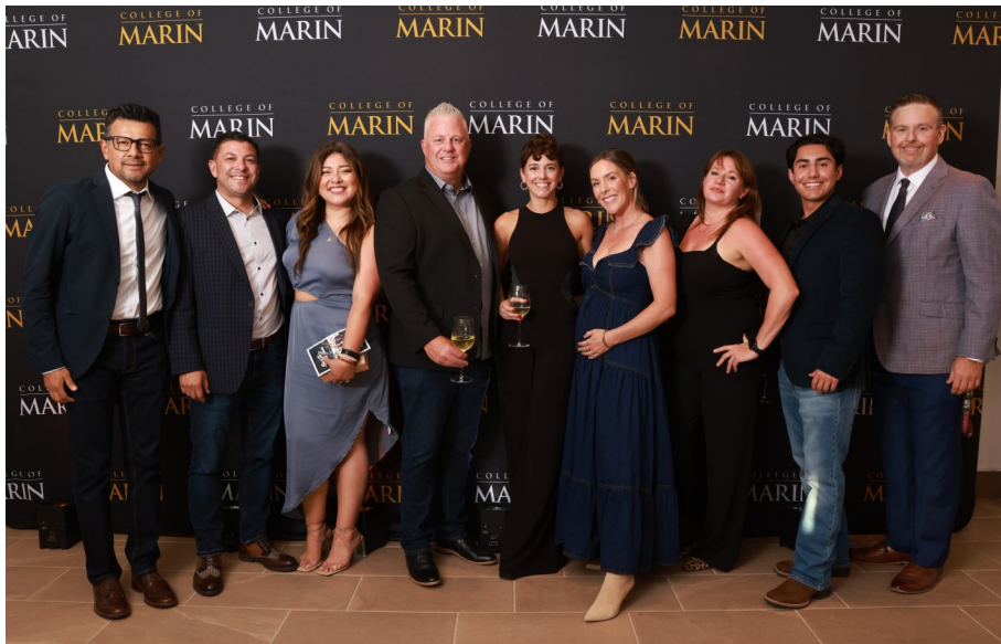
Future Flooring, Diamond Sponsor, Black Tie & Blue Jeans, Jonas Center