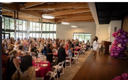
Bill and Adele Jonas Center