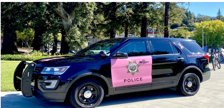
COM Patrol Car—Breast Cancer Awareness Month

Thank you for being a part of our diverse and vibrant College of Marin family. Together, we can make a positive impact, raise awareness, and celebrate the richness of our shared humanity.