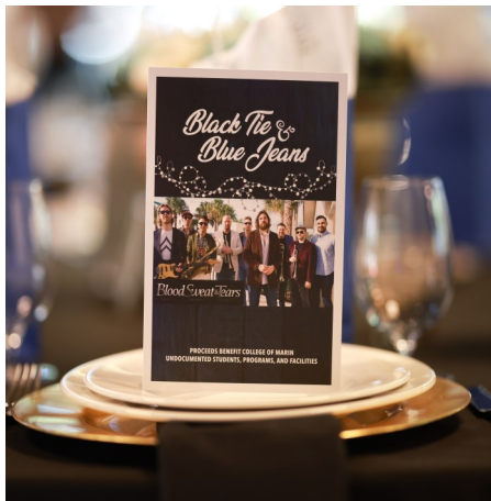
Program, Black Tie & Blue Jeans

"You are stronger than you seem, braver than you believe, and smarter than you think."