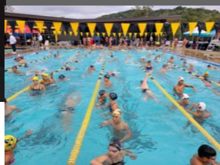
Miwok Aquatic & Fitness Center