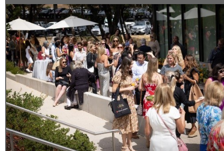
Bill and Adele Jonas Center