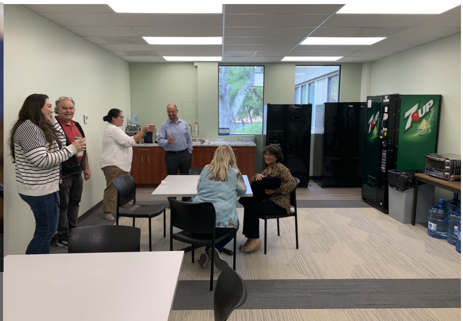
COM Staff, New Breakroom, Indian Valley Campus