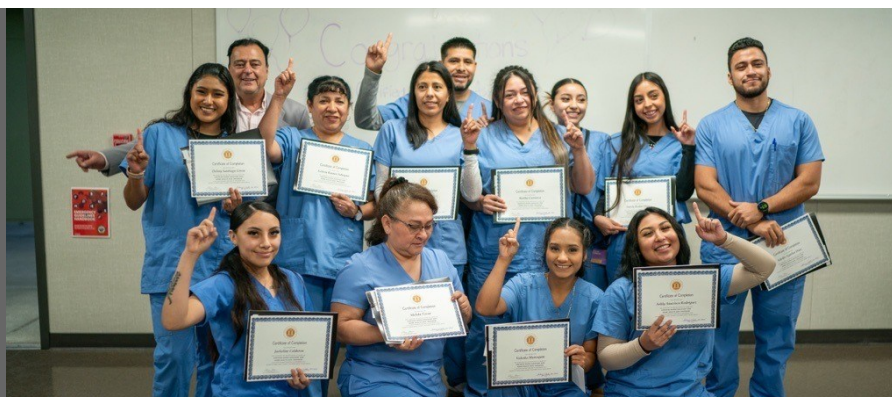
Congratulations to the first cohort of the CNA (Certified Nursing Assistant) Program!