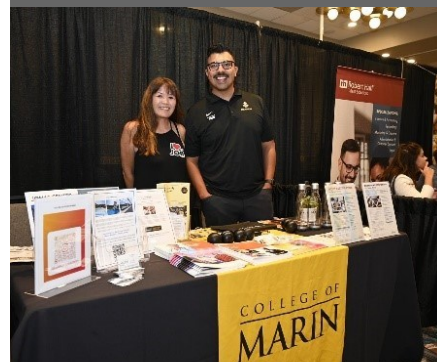
COM Staff, Marin Co. Business Expo