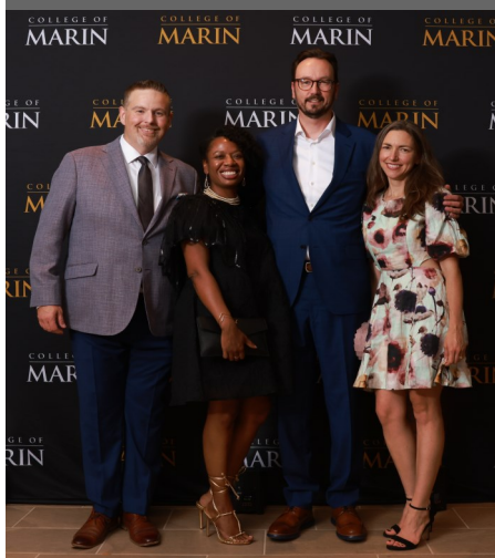
Executive Staff, Black Tie & Blue Jeans