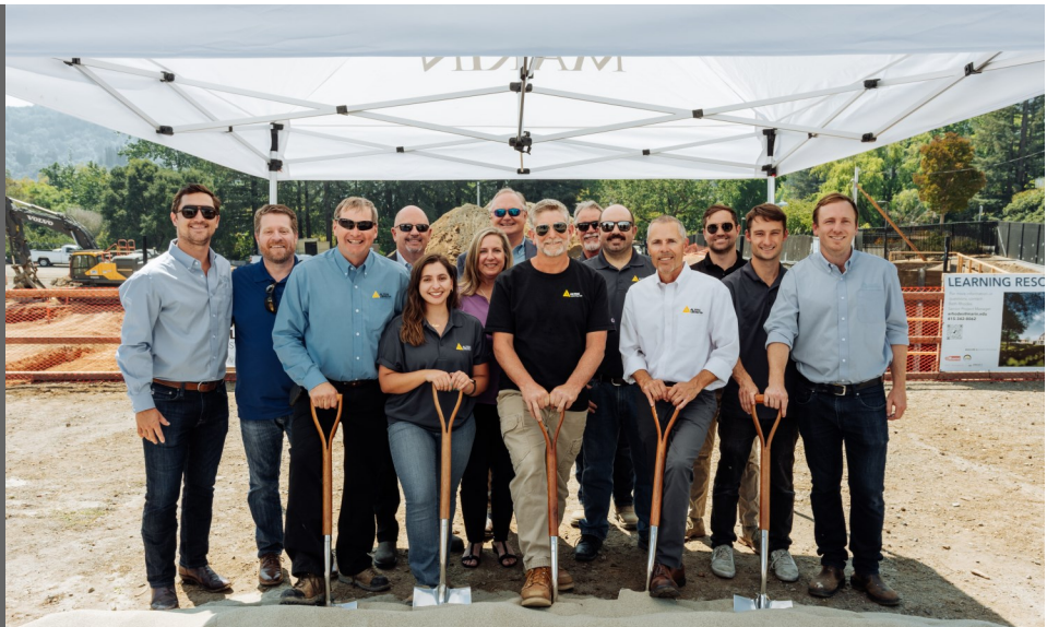
Alten Construction, Learning Resources Center Ground Breaking Ceremony, Kentfield

Planting and irrigation has been completed outside of the Miwok Aquatic and Fitness Center to add visual appeal, and to help with erosion control.