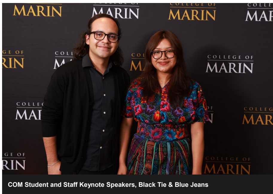
COM Student and Staff Keynote Speakers, Black Tie & Blue Jeans